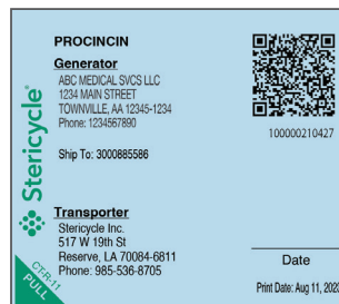
Non-Hazardous Waste Pharmaceuticals