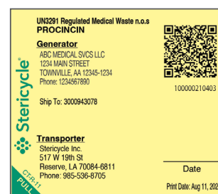
Chemo or Path