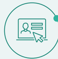
Redesigned Customer Portal

To learn more about these exciting changes and find a detailed overview of enhancements to your invoice, scheduling notifications, and customer portal visit us at: