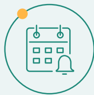
Enhanced Service Notifications